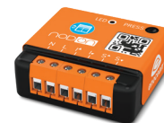
Roller Shutter Module SIN-2-RS-XX