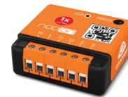
Relay Switch 1 Channel Dry Contact SIN-2-1-XX