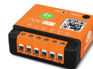
Relay Switch 2 Channels SIN-2-2-XX