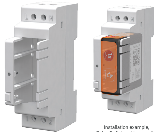
Installation example, Relay Switch sold separately.

I install the Relay Switch 1 channel dry contact directly on the electrical panel to turn the towel dryer connected