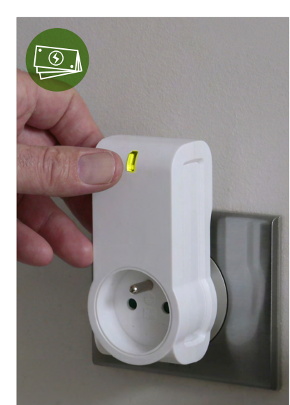
Monitor the energy consumption, and reduce my electricity bills