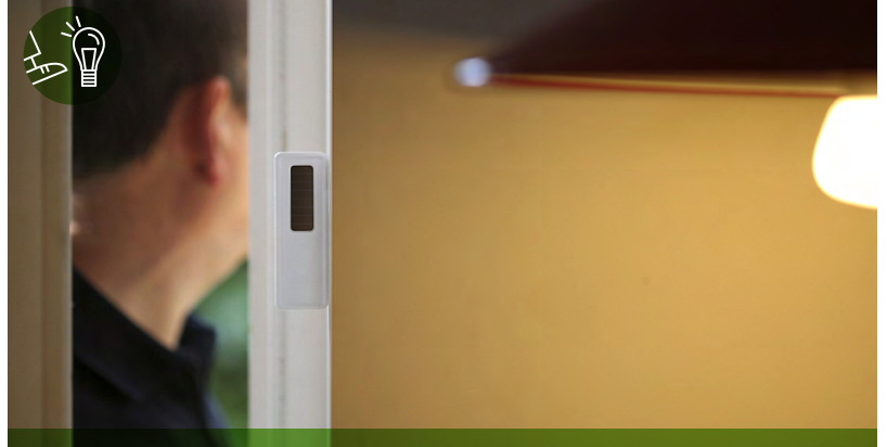
Switch ON or OFF automatically my lights while somebody is entering the room